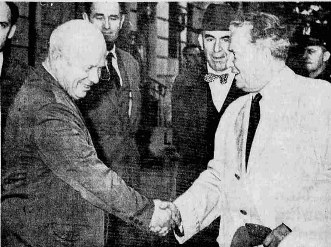
KHRUSHCHEV, TITO MEET—Soviet Premier Nikita Khrushchev, left, welcomes one-time arch foe Marshal Tito of Yugoslavia to the Soviet UN headquarters on New York's Park ave. Tito said "hello" and went inside the building.

Regional Edition No. 164 MEDFORD, OREGON, WEDNESDAY, SEPTEMBER 28, 1960 22 Pages 55th Year Price 10 Cents