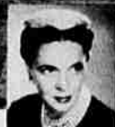
MELANIE KAHANE, FAMOUS DECORATOR, SAYS:

"TAKE A 'GUEST'S EYE' VIEW OF YOUR LIVING ROOM"