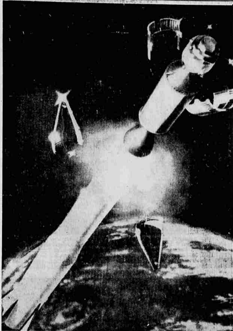
'BLUE SCOUT' ROCKET —The Air Force Wednesday launched its first "Blue Scout" rocket on a 17,000 mile journey into space. Authorities said the Blue Scout could "conceivably" pay its way by locating a "safe area" for high altitude testing of nuclear explosions and in developing a system of detecting similar tests by other nations. This artist's conception shows the second and third stages as they separate in space.