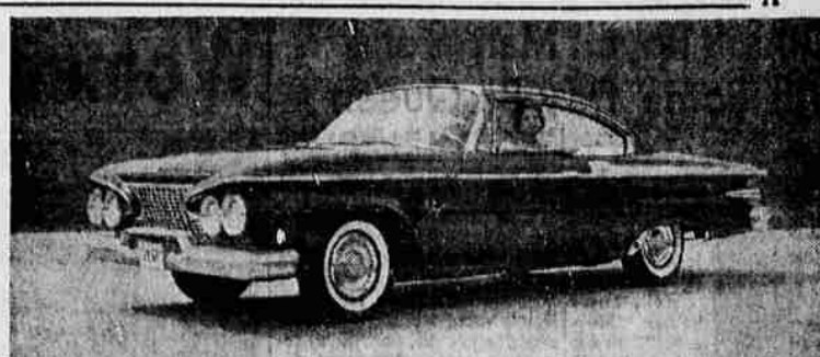
NEW PLYMOUTH - The 1961 Plymouth has a new look of beauty and a new ride of stability, according to company officials. The car has made major engineering and styling gains in the areas of economical operation, trouble-free driving, luxury-car appearance and solid riding characteristics.