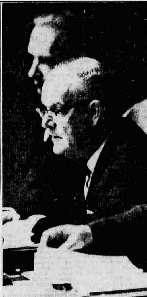
HEADS GENERAL ASSEMBLY - Ireland's Ambassador Frederick H. Boland presides after his election as president of the General Assembly's 15th session at the United Nations in New York. On dais with him, to the left, is United Nations Secretary General Dag Hammarskjöld.

Washington - (UPI) - The most sacred period of the Jewish religious calendar begins at sundown tonight with the observance of Rosh Hashana, the Jewish new year. Rosh Hashana, a Hebrew term which literally means "head of the year," opens a 10-day period of repentance and rededication which ends with Yom Kippur, the day of atonement. During this period, commonly called the "high holy days," devout Jews engage in sober introspection and spiritual stock-taking. They review their conduct in the year gone by, repent their shortcomings and resolve to live up to high ethical principles in the year ahead. Tonight's ceremonies will inaugurate the year 5721 on the Jewish lunar calendar. Orthodox and conservative branches of Judaism observe Rosh Hashana for two days. Reform Jews have a one-day observance. Unlike the celebration of the Passover, which centers in the home, Rosh Hashana is primarily an occasion for corporate worship in the synagogue. Yom Kippur, which begins at sundown Friday, Sept. 30, is the culmination of the sacred period and is regarded as the holiest day of the Jewish calendar. Many Jews observe it with total abstinence from food and drink. Gorillas may be thin or fat, and their facial expressions vary greatly. Some reveal marked family likeness, just as people do. The eastward "jet stream" in the upper atmosphere, sometimes speeding at more than 250 miles an hour, is higher in summer than winter.