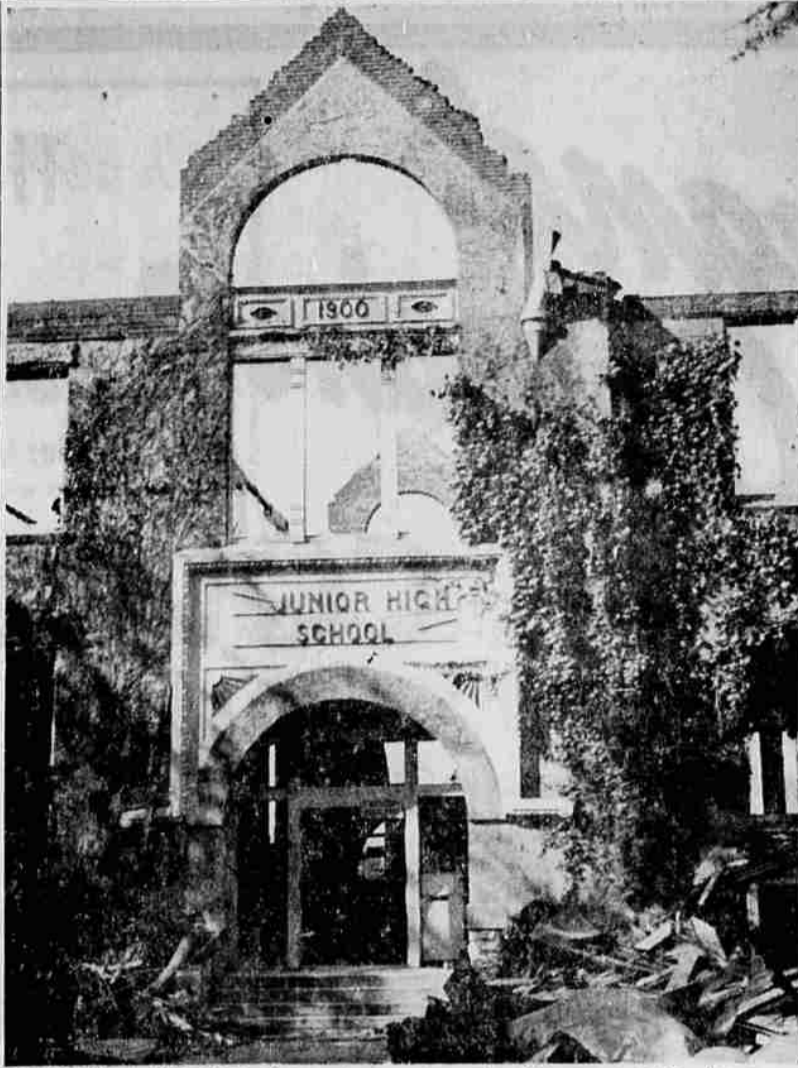
DOWN WITH THE OLD—Not much remains of the old junior high school in Ashland—except perhaps a few memories—as workers this week continue to tear down the building to make room for a shopping center. Classes opened Monday morning at Ashland's new junior high school on Walker ave. and first day enrollment was 636, including 214 seventh graders, 228 eighth graders and 194 ninth graders.

Speakers will attend numerous valley club meetings to educate the general public. The clinic will be for all age groups.