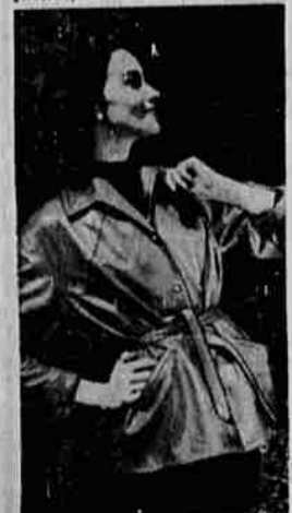
TIE-BELT - Over-the-hip length, self tie-belt are silhouette news in a smooth leather jacket. Note batwing shoulder line, push-up sleeves, slit pockets.

There are junior versions of the tailored jacket for young girls, as well as handsomely styled full-length coats in cowhide, coltskin and cabretta leathers, with self-leather belts, generous slash pockets, and a wide range of bright colors to appeal to 'tween and teen-agers. Cardigan of leather with knit sleeves makes an ideal school jacket.