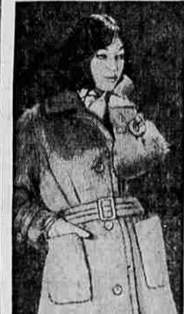
SHAGGY — Shaggy look gets a luxurious interpretation in knitted mohair - and acetate coat. It's belted, generously patch-pocketed. By Tricosa-Feder.

Casual coats trend to the three-quarter length, with the duffel coat in the lead.