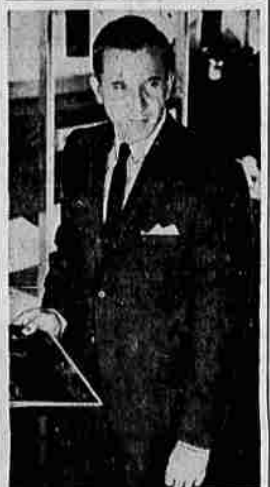
SMALL PLAID —A miniaturized muted plaid of black and gold highlights this continental three-button wool-worsted suit.

JUMPERS TAKE PART - Jumpers play their part on the sportswear scene. Some are cropped for a tunic look over skirts or pants.