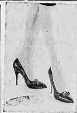
SILHOUETTE —Needle toe, a leading fall silhouette in feminine footwear, is illustrated by this violet smooth leather pump for late day and evening wear. Shoes by Customcraft.