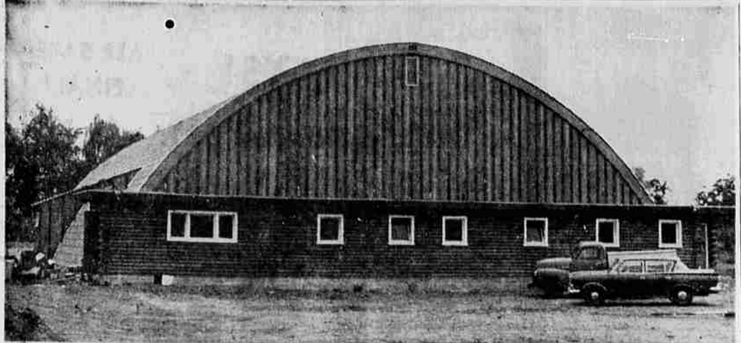
NEW ROLLER RINK — Providing a place for entertainment and exercise for valley residents will be this roller skating rink being constructed on Highway 99 south of

Medford. It is one of several recently completed buildings for recreational purposes. Others include new bowling lanes in Medford and Ashland.