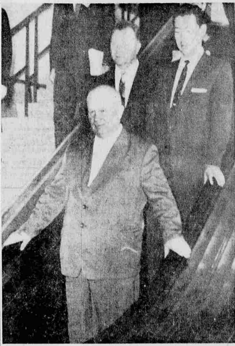
LEAVES GENERAL ASSEMBLY —Soviet Premier Nikita Khrushchev, followed by aides, rides an escalator at the United Nations building after leaving the morning session of the General Assembly. He beamed and smiled at the session even after reports by Soviet security police that "former Gestapo agents" disguised as press photographers, were going to make a bid to assassinate him with a gun hidden in a camera. But for the first time he appeared grim and angry as he returned to his Park ave. headquarters.

Hammarskjold, in a cable to Katanga President Moise Tshombe, warned bluntly that "it is the duty of the United Nations force to protect the civilian population and thus