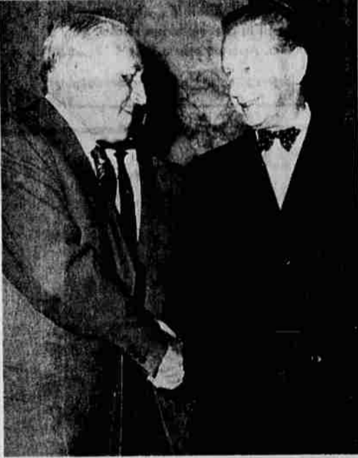
SOVIET DELEGATE ARRIVES - Soviet Deputy Foreign Minister Valerian A. Zorin, left, shakes hands with UN General Secretary Dag Hammarskjold at the United Nations in New York. Zorin replaces Deputy Foreign Minister Vasily V. Kuznetsov as head of the Soviet delegation. (UPI Telephoto)