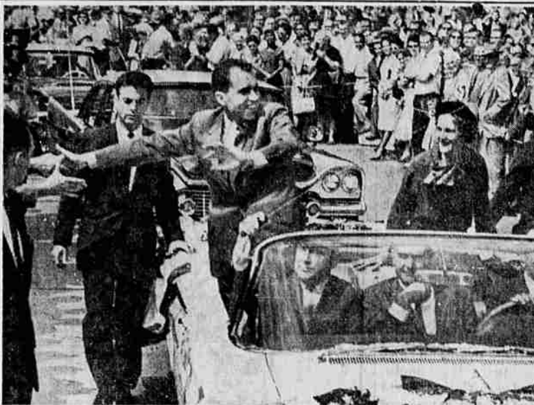
NIXON GREETED — Surrounded by admirers, Vice President Richard M. Nixon and Mrs. Nixon are shown following their arrival at Indianapolis, Ind., Monday on the first stop of the GOP presidential nominee's 14-state campaign tour.

He rejected suggestions that the United States was "losing ground" overseas in the contest with Communism. He acknowledged Red success in Cuba and The Congo but said that when one looked at the global picture as a whole there were "many reasons for encouragement."