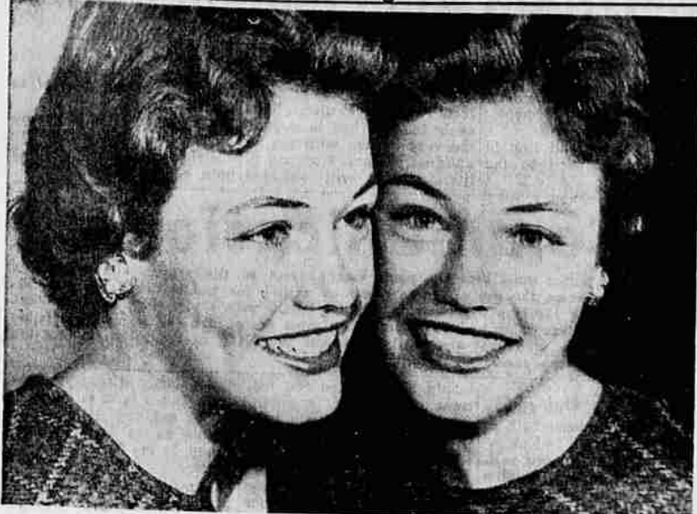
MIRROR, MIRROR ON THE WALL—No, its Mich., the new Miss America. The 18-year-old beauty is shown as she met the press Monday in New York City.