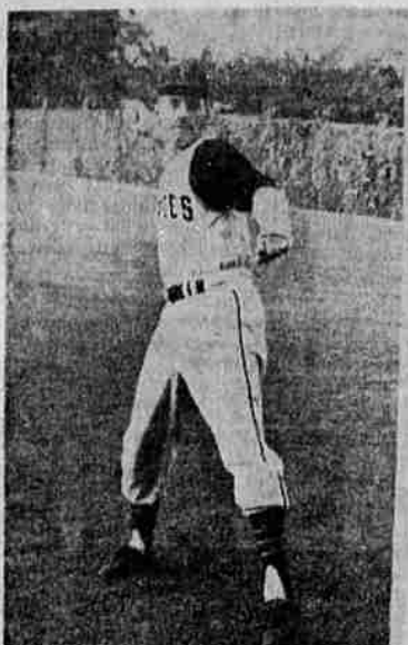
KEEPS IN SHAPE—Alling Pittsburgh Pirate shortstop Dick Groat is keeping in shape while his broken left wrist heals. The wrist was broken by a pitch thrown by Milwaukee pitcher Lew Burdette in a game