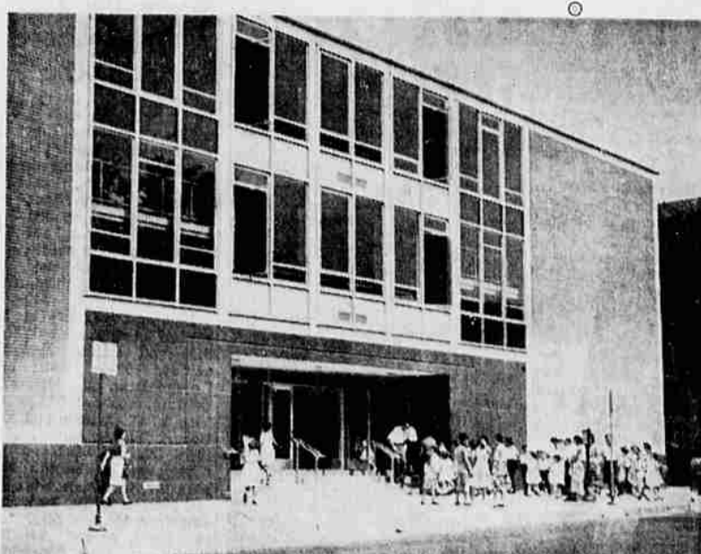
NEW SCHOOL - Our Lady of Angeles school children filed into a gleaming new school at the site where 21 months ago fire killed 92 students and three nuns in Chicago. Students of Our Lady of Angeles parish of Chicago attended school under the same roof for the first time since the fire.

For those who do not wish the Tuition Plan, but still desire to make installment payments, Linfield has the one-third down payment plan on a one-year basis.