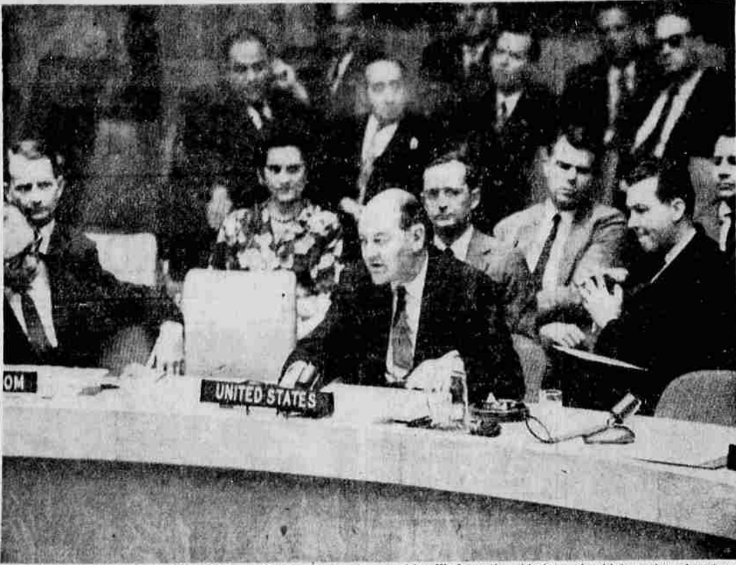
ADDRESSES SECURITY COUNCIL — Newly-appointed U.S. Ambassador to the United Nations, James J. Wadsworth, is shown as he addressed a Security Council session Thursday. Discussing the possibility of serious negotiations on disarmament at the coming session of the General As-

Private pilots have been warned to stay out of the air, coast to coast, and from the Mexican border to the Canadian arctic and Alaska.