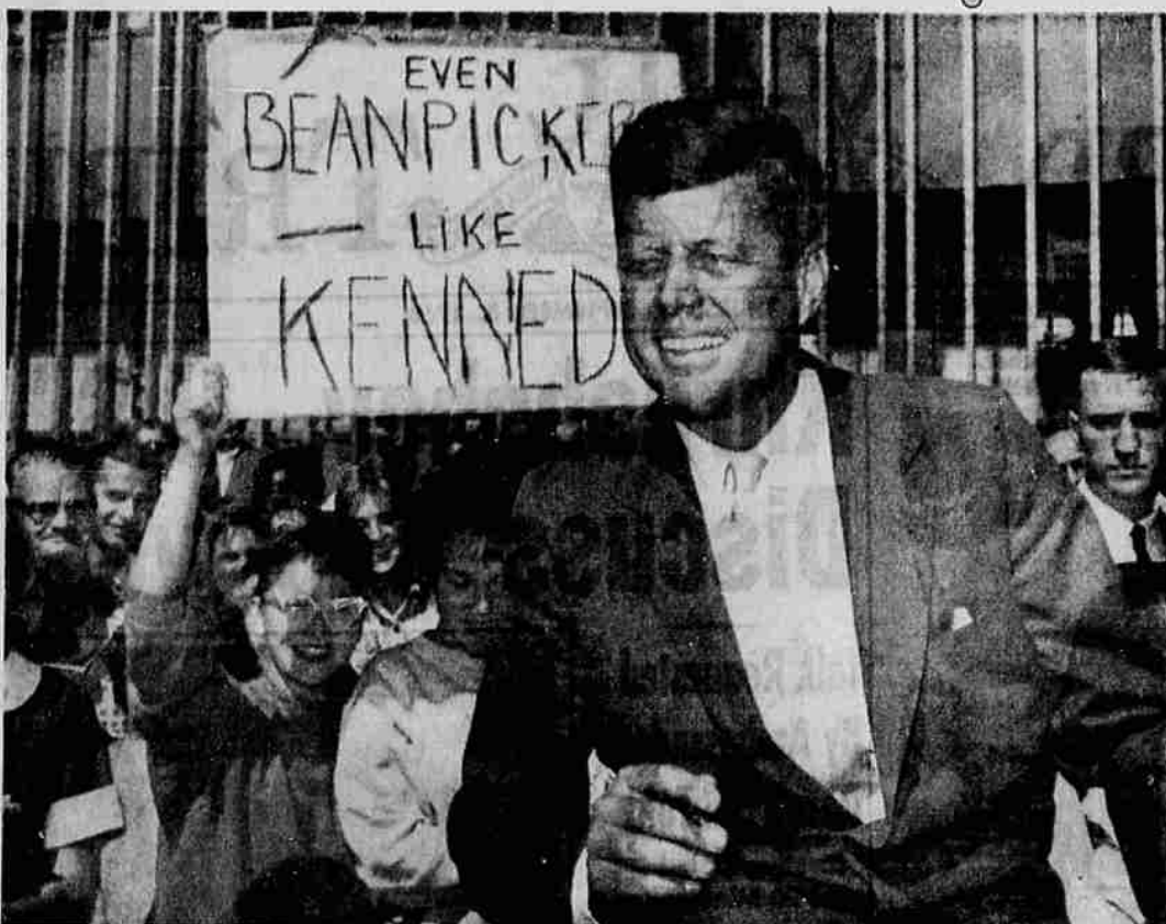
THEY LIKE KENNEDY—"Even beanpickers like Kennedy" was the sign held up during the public rally in Eugene's Courthouse Square Wednesday, Democratic presidential candidate John F. Kennedy assailed the Republican program on education in his speech at the rally.