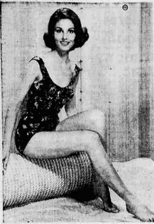
BREAK COMES FAST —Paula Prentiss, above, a new Hollywood actress whose movie break came so fast her luggage traveled east as she came west, graduated from Northwestern University in June. A movie agent signed the attractive miss so fast "I was scared out of my wits," she says.