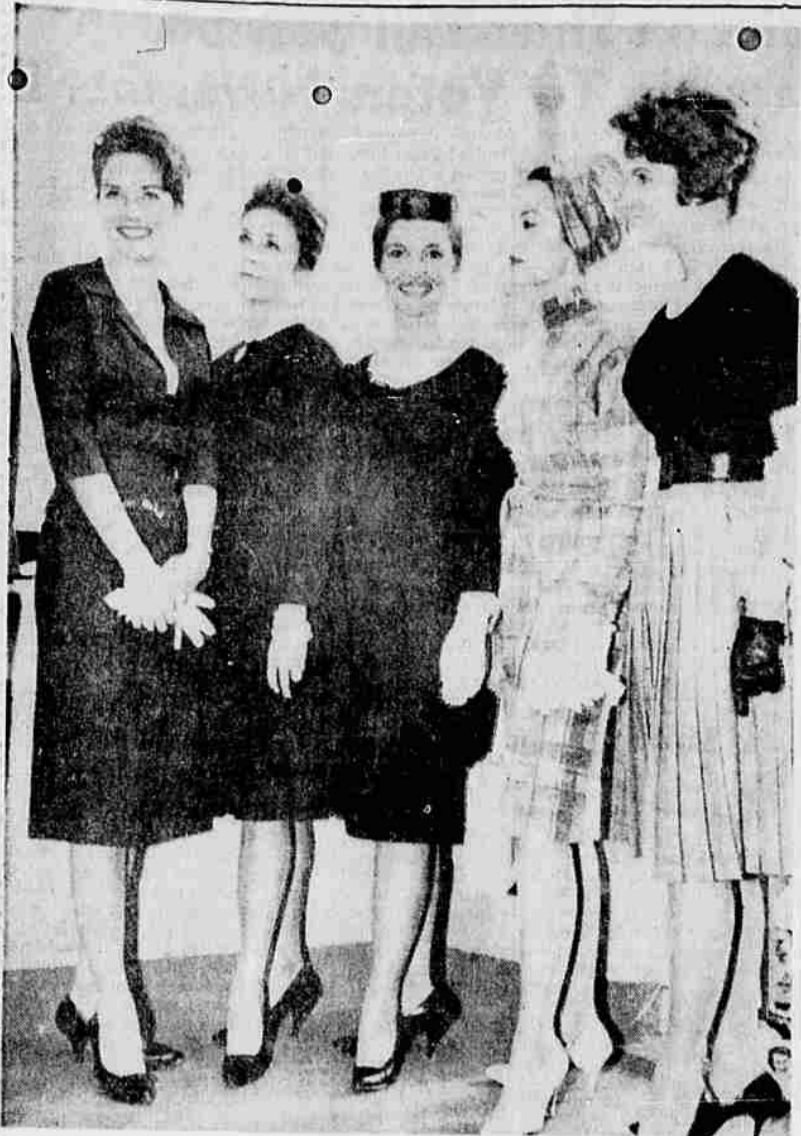
SHOW OF BEAUTY —All but one of the past six Miss Americas assemble for a stunning show of beauty at Atlantic City, N. J. From left, the Miss Americas are Lee Ann Merriwether, 1955; Marian Ann McKnight, 1957; Mary Ann Mobley, 1959; Sharon Kay Ritchie, 1956, and the current crown bearer, Lynda Mead. Absent was the 1958 winner, Marilyn VanDerbur.