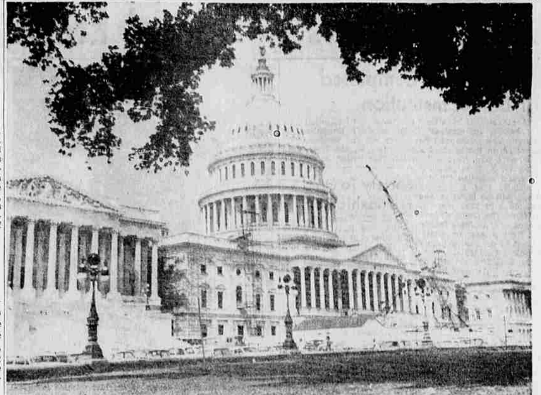
CAPITOL CONSTRUCTION —Construction work on the new extended East Central front of the Capitol in Washington is rapidly nearing completion as shown in this photo taken Wednesday. Speaker of the House Sam Rayburn will officiate at a brief ceremony Sept. 2 in connection with the raising of the first flag over the new front.

Authorities said no identification could be made on a hitchhiker picked up near Salem and questioned by a Lane county deputy.