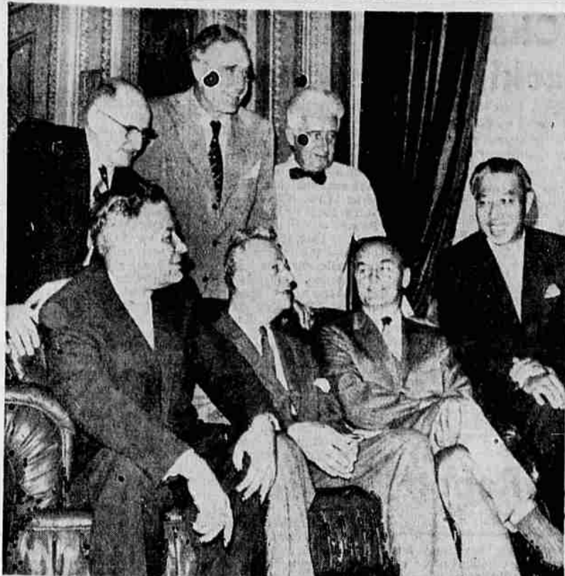
'TRUTH SQUAD' —Seven members of the eight-man GOP "truth squad" are shown Thursday after discussing their activities at the end of the bob-tailed Congressional session. They announced they were reconstituted as a campaign "fact squad" to range the country and "set the record straight." Members of the group, which was created by GOP Presidential Nominee Richard Nixon, are (standing, from left) Sen. Francis Case (S.D.), Sen. Prescott Bush (Conn.), Sen. Kenneth Keating (N.Y.) and (seated) Sen. Roman L. Hruska (Neb.), Sen. Everett Dirksen (Ill.), Sen. John Williams (Del.) and Sen. Hiram Fong (Hawaii).