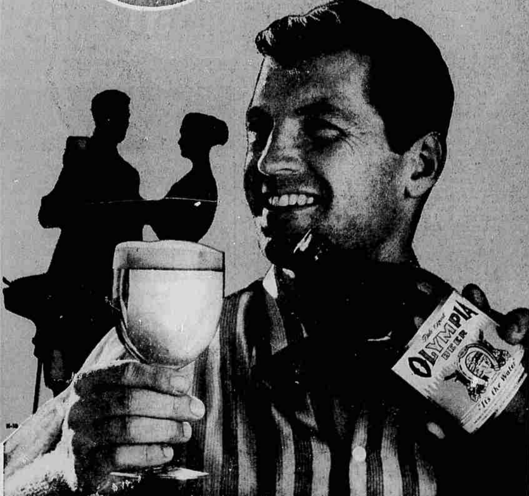
Visitors are always welcome to "One of America's Exceptional Breweries," Olympia Brewing Company, Olympia, Washington, U.S.A., 8:00 to 4:30 every day. *Oly*