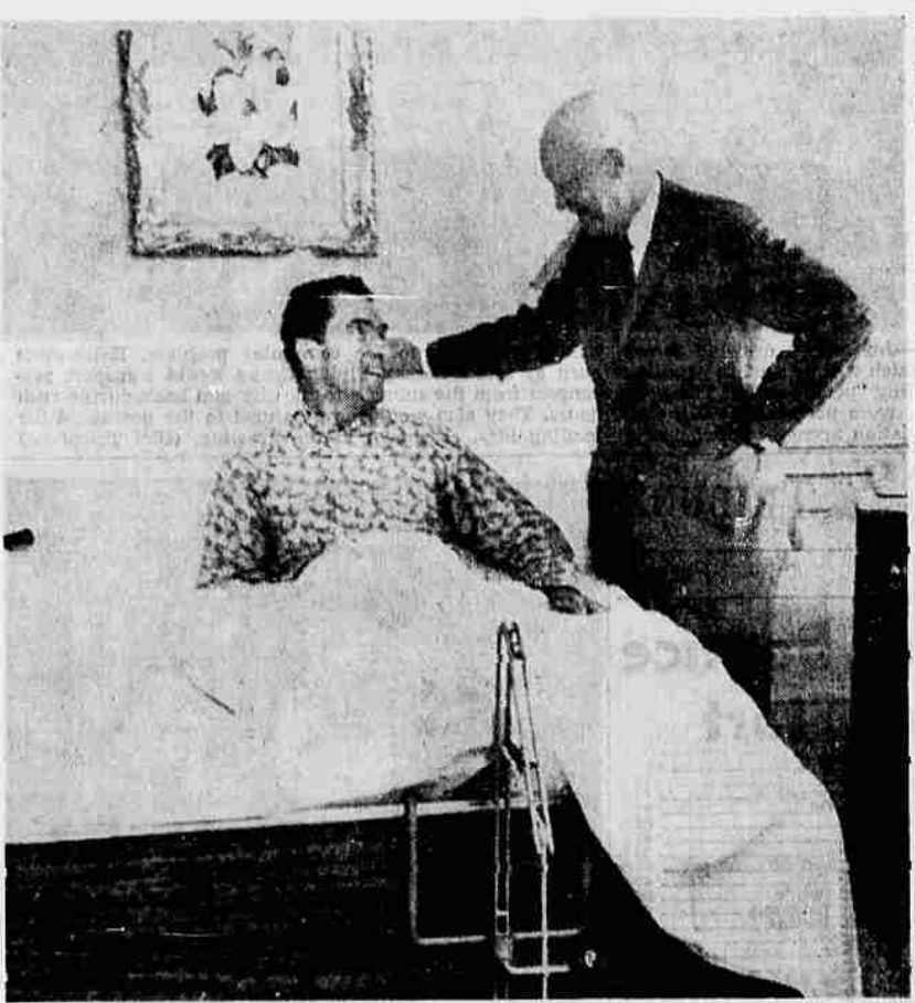
'GOOD PROGRESS'—President Eisenhower chats with ailing Vice President Richard M. Nixon at Walter Reed Army Medical center Tuesday. Eisenhower compared his "football knee" injured during playing days