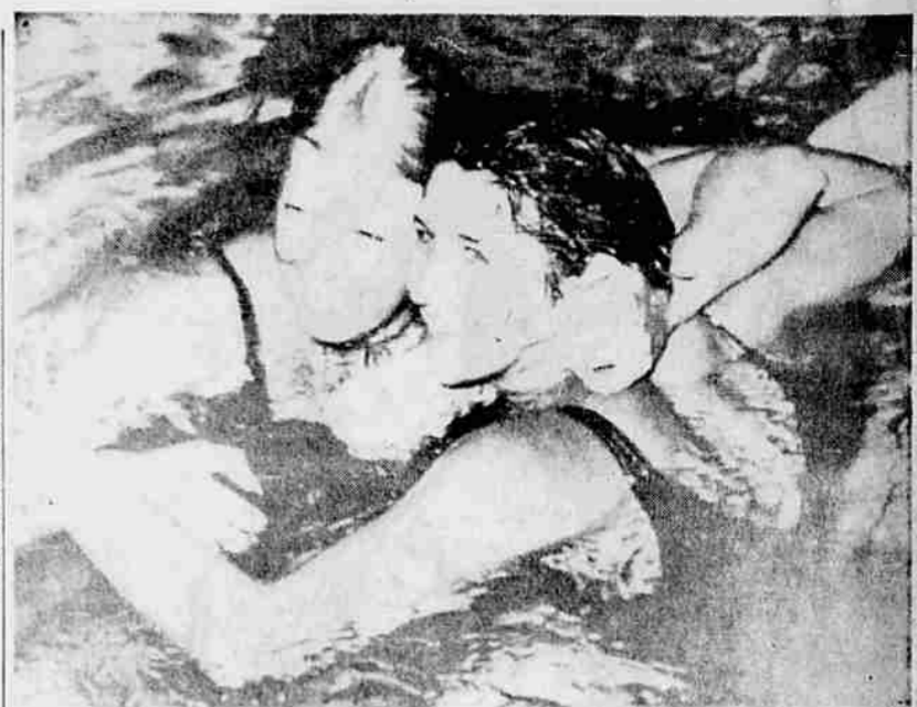
GETS CONGRATULATIONS — Australia's Dawn Fraser (right) gets a congratulatory embrace from Chris Von Saltza of the U.S. after Miss Fraser won the women's 100-meter freestyle swimming event in 1:01.2 to set a new Olympic record. Miss Von Saltza had been favored in the event.