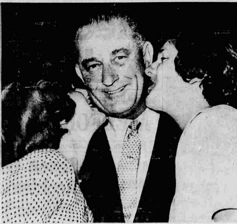
B-DAY FOR LBJ—The Senate took a half-hour recess Saturday for a surprise birthday party for Sen. Lyndon B. Johnson. The majority leader and Democratic vice presidential candidate is 52. His daughters, Lucy Baines (left) and Lynda Bird, congratulate their dad.