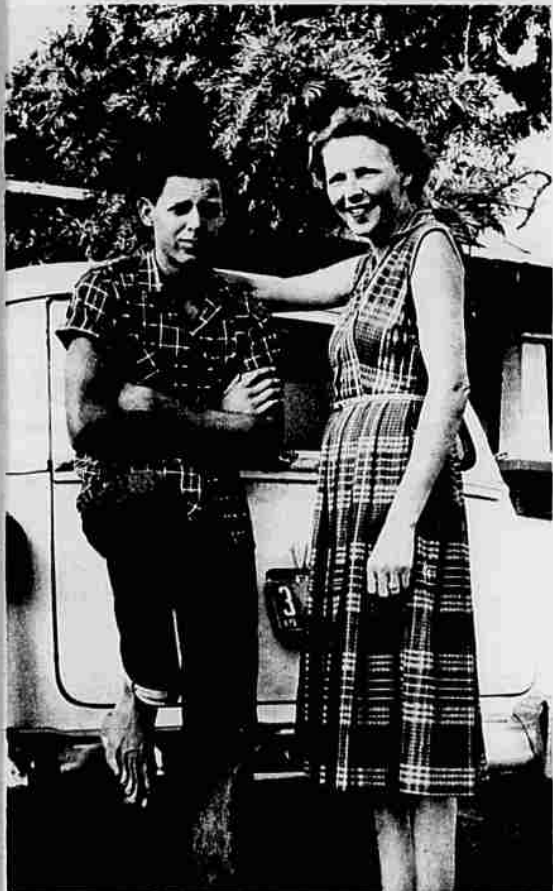
The author and the heroine of his story lean against the villain.

dent, Mom had been ill at home, recovering from a rheumatic disorder of the left knee.