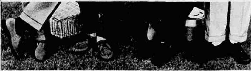
Campus Favorites include: Plain Toe Slip-On in Tiger, Moc Toe Oxford in Gunsmoke, Moccasin Slip-On in Scarlet Feather, Hi-Riser in Loden Green. All styles made in selection of colors, Narrow, Medium, Wide widths to size 12. Some in Extra-Wide and Slim, and to size 16.