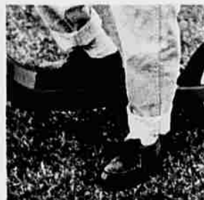
Little league winner is Swiss Moccasin for boys and youths in Gunsmoke, 3 other colors. Also Slip-On Moccasins, Oxfords, and Chukka Boots in 3 widths, sizes 10 to 6.