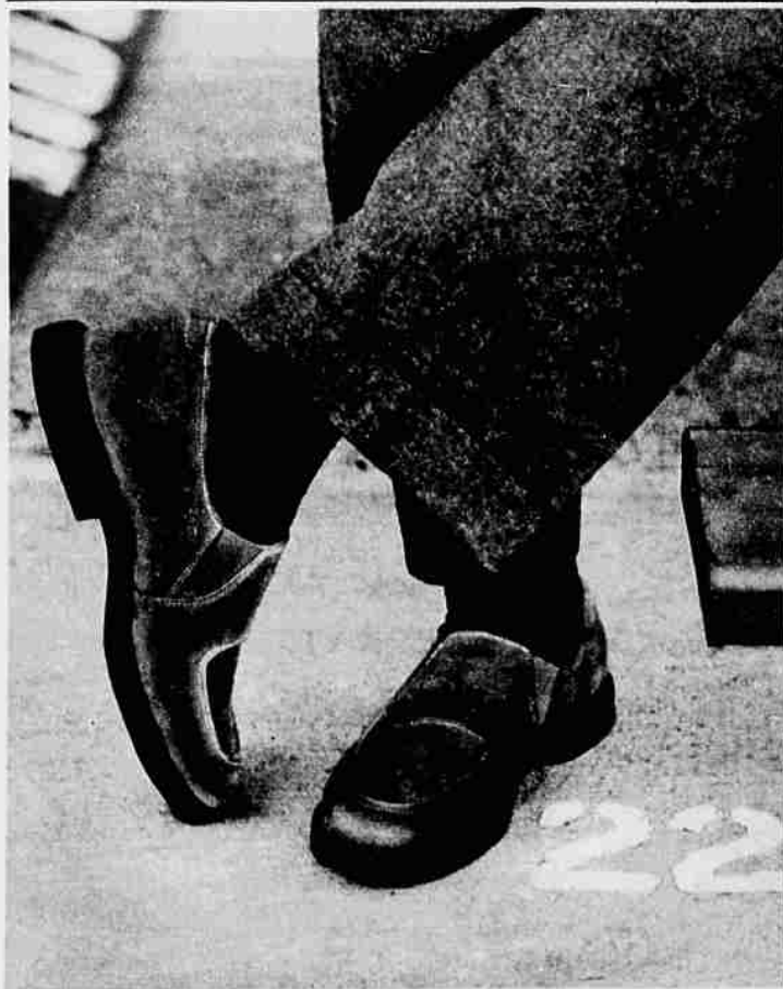
Alumni really cheer the Shield Moccasin Gored Slip-On in Maverick, 2 other colors. Men's sizes, in widths, to 12.