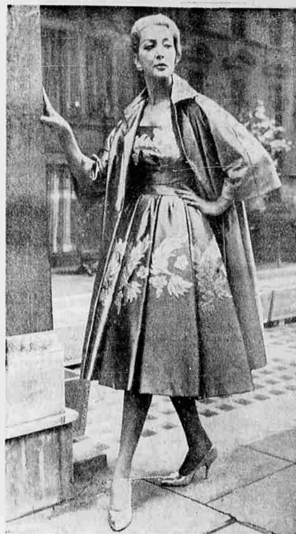
Norman Hartnell, dressmaker to Britain's royal family, calls this striking cocktail costume "Town Mouse." Done in mouse-grey satin with gold lace applied on the strapless bodice and full skirt, the gown has a full length casually-cut coat.