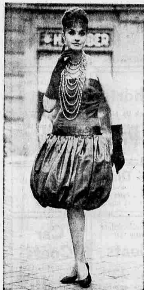
The balloon skirt of this Marucelli of Rome design drops the waistline without ignoring natural curves in a striking cocktail dress of brown satin and faille. The strapless bodice, which alternates the fabric in stripes, serves as a backdrop for the multi-strand gold necklace.