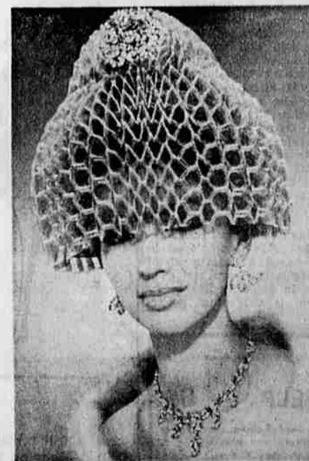
The honeycomb hat, natural companion to the beehive hairdo, provides an elaborate touch to cocktail costumes from Lanvin-Castillo of Paris. The beige and white pleated tulle hive is decorated with a diamond clip from Cartier.