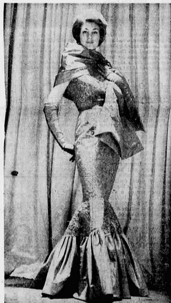
Flaming red lace trimmed with matching taffeta cuts a brilliant figure by night as Norman Hartnell of London creates a slinky evening gown. Reminiscent of the Thirties, the gown follows the curves to the knees, then flares into a full taffeta flounce.