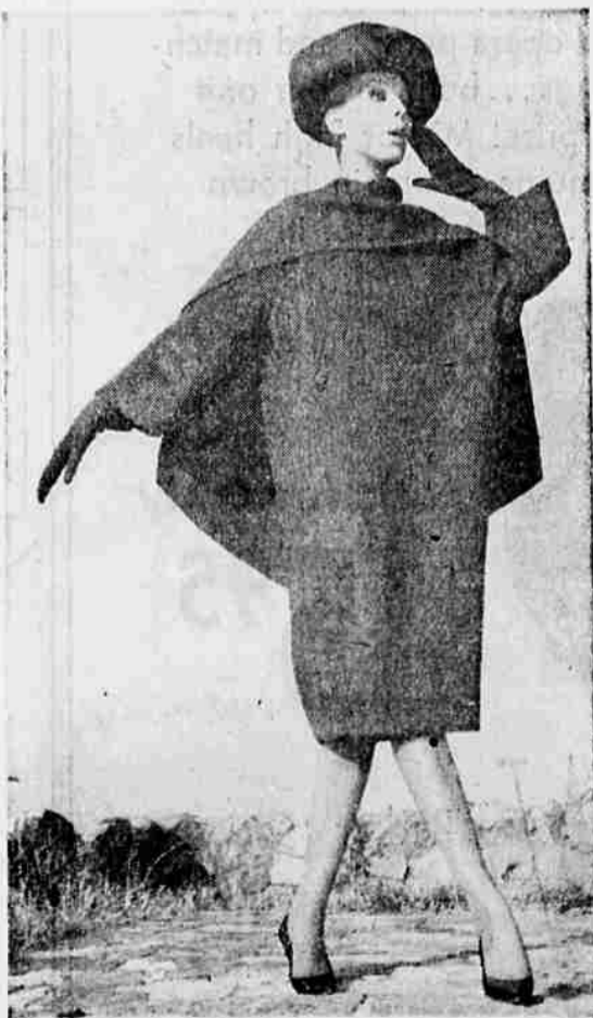
Buttons are swept to the right in Sarli of Rome's striking grey camel's hair coat which has its own little round collar and dramatic cape that bunches across the front and sweeps down in a low point toward the back hem. Both coat and cape are lined in brilliant red.