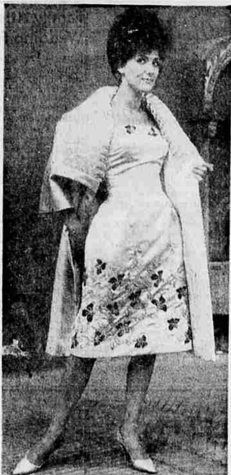
Red velvet flowers bloom at the hem and neckline of a short evening gown (at left) from the fall collection of Centinoro of Rome. In pale beige satin, the gown has a matching coat with elaborate pleating on the huge collar. Chanel (right) does her beloved "little suit" in violet tweed with a frivolous violet fringe. Chanel's designs are copyrighted; copying is forbidden.