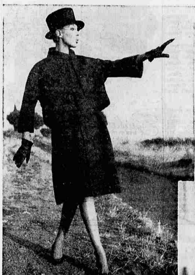
Reminiscent of the colorful costumes of the bull ring, Sarli's bright red wool suit features a short, loose jacket with deep back pleat over a short loose skirt with deep front pleat. Matching silk cord ties, ending in little pompoms, hold the jacket closed.