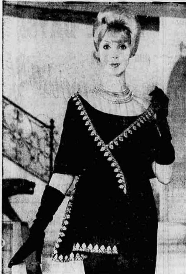
The famed fashion house of Lanvin-Castillo in Paris featured this gold and sequin embroidered dinner gown in its 1960 fall collection. The shawl drapey gives a Spanish accent to the dress of black wool crepe.