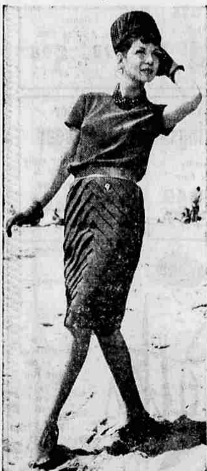
This brown crepe daytime dress by Balestra of Rome has a pine-cone pattern skirt topped by a narrow satin belt, plain bodice and short sleeves.