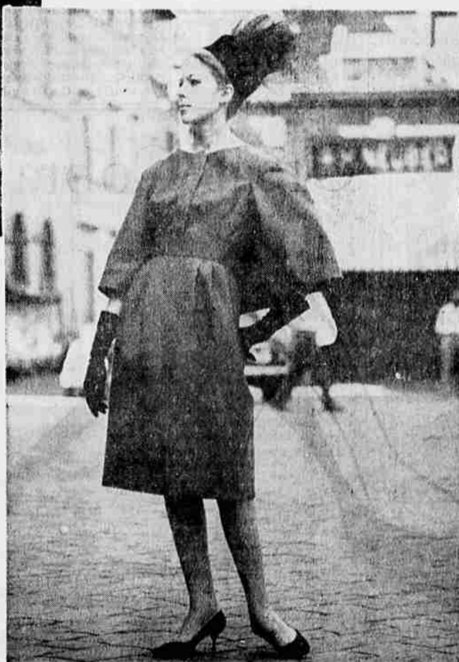
Short, wide sleeves that swing into a cape effect at the back lend a costume look to a daytime dress from the fall collection of Fabiani of Rome. Done in a thickly-corded red silk and wool fabric, the dress has a wide belt marking a natural waistline.

For the first time, The Mail Tribune today carries a full page of pictures of fall fashions just released by the Paris, Rome and London couture houses. Additional Paris designs will be released August 30.