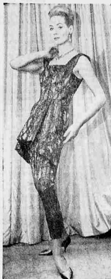
Maitli of London sets a hobble at the base of a printed satin evening gown for gala fall occasions. The square-necked gown, with flaring tunic drapey, is lined in white to the knee where the skirt narrows to a tube.