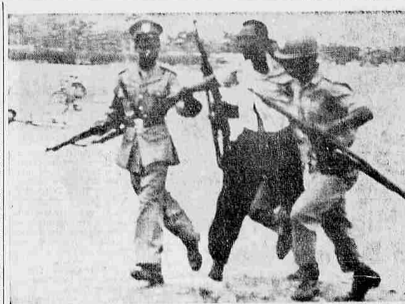
CONGO VIOLENCE—Police take in tow opening of a pan-African conference. Further outbreaks of violence erupted in the Congo Saturday.