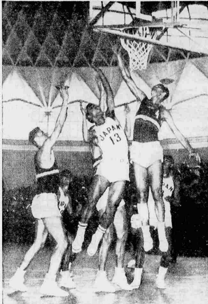
SUPERIOR HEIGHT TELLS STORY — A The Hungarian team, with vastly superior Japanese basketball player tries in vain to height, downed the Japanese five, 93-86, break up a play by Hungary during Olympic basketball competition in Rome today.