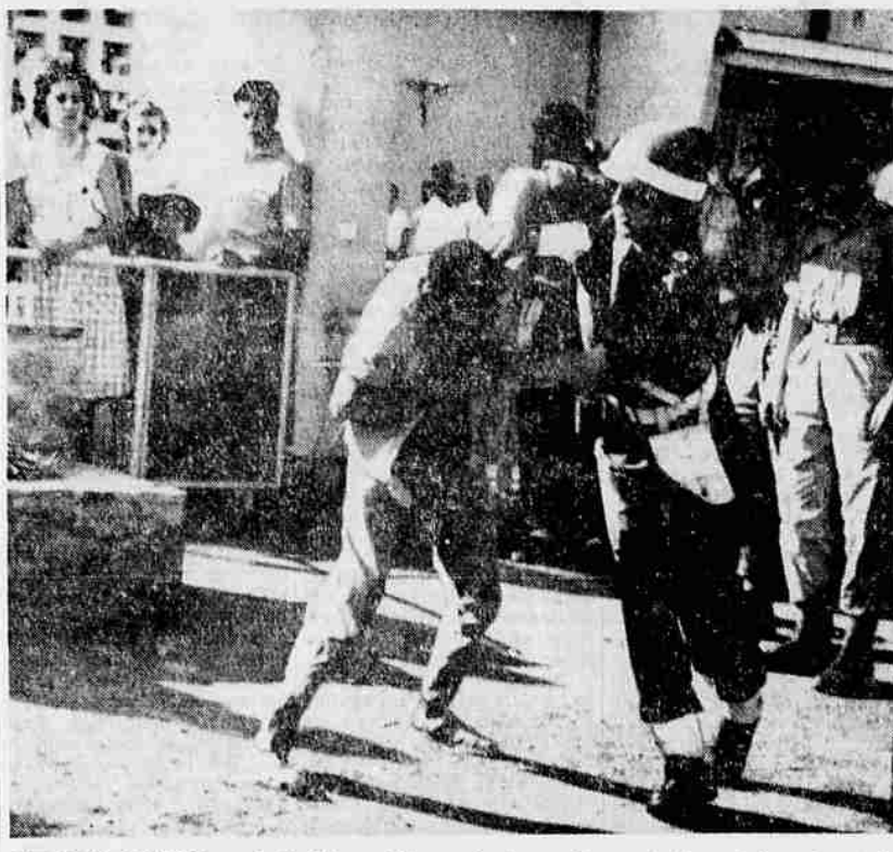
RESISTS ARREST — A Belgian military police officer scuffles with a supporter of the Balubakat political party after the native tried to escape following his arrest during a demonstration at the airport in Elisabethville, Katanga province, this week. Watching them tangle are Belgian citizens and troops.

The annual meeting of the Jackson county chapter, American Red Cross, will be held Thursday, Sept. 8, at the chapter house at 60 Hawthorne ave., Medford, officials have announced. The meeting will start at noon. Luncheon reservations may be made by telephoning the Red Cross office, SPring 2-4405, no later than Tuesday, Sept. 6.