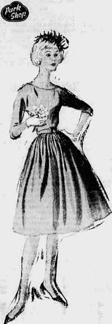
IN TUNE WITH FALL FASHION . . . PURITAN FOREVER YOUNG

A high note of sharp colorings in a washable 80% Orlon Acrylic—20% wool. Scoops low in the back . . . high in the front. Can easily go from desk to dinner and be the life of any party. Black. Half sizes.