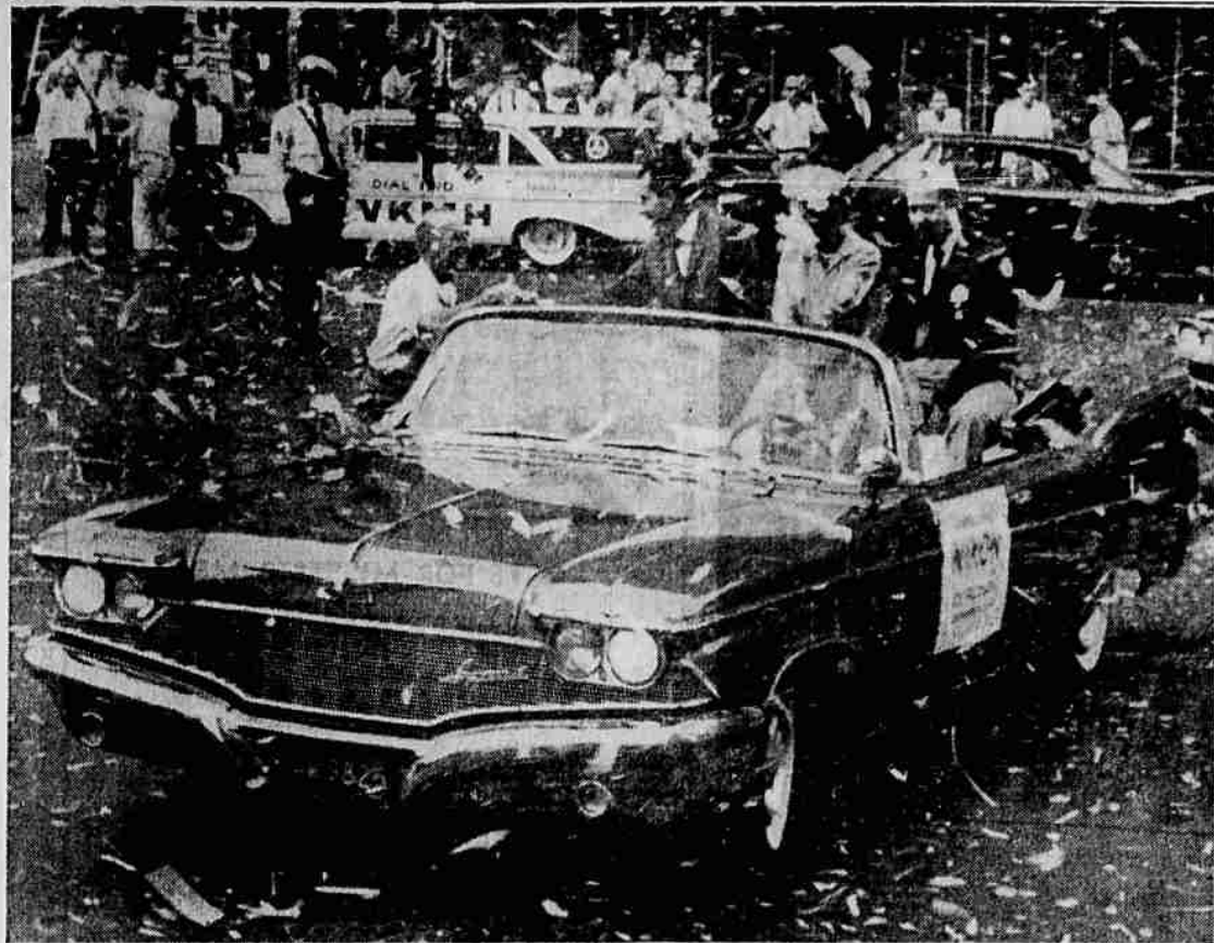
BIG WELCOME —Vice President Richard M. Nixon and his wife, Pat, are showered with confetti as their motorcade passes through downtown Detroit Wednesday. The vice president was in Detroit to address the Veterans of Foreign Wars convention. A Nixon well-wisher is shown shaking hands with the vice president.