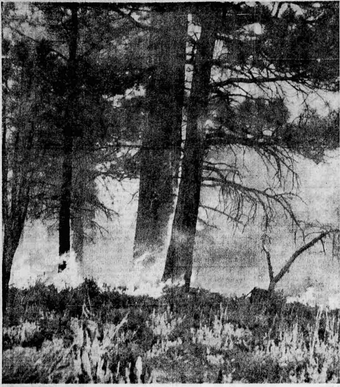
FIRE UNCONTROLLED — Flames from nearby Donner lake fire lick at trees as a fire went uncontrolled through thousands of acres of valuable timber near the Nevada-California line over the week end.