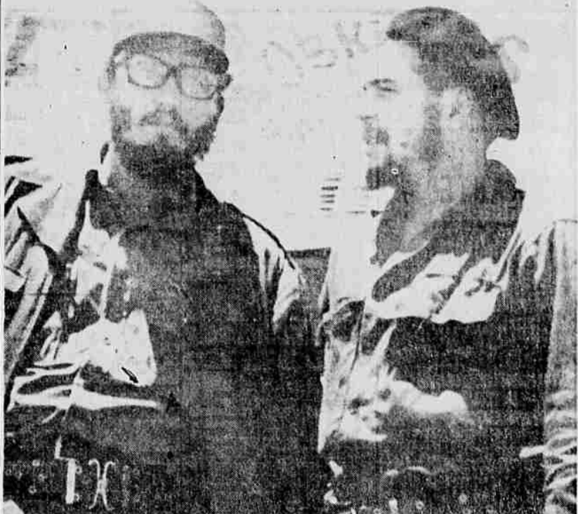
REVIEW TROOPS—Cuban Premier Fidel Castro (left) and Che Guevara review newly trained militia at San Julian Air base in Cuba Sunday. Castro said Cuba's answer to U.S. "aggressive" moves at the OAS meeting in Costa Rica is a militia and a "people armed to the teeth."

NOW YOU CAN LISTEN AROUND THE CLOCK TO KMED BETTER MUSIC AND ALL THE NEWS