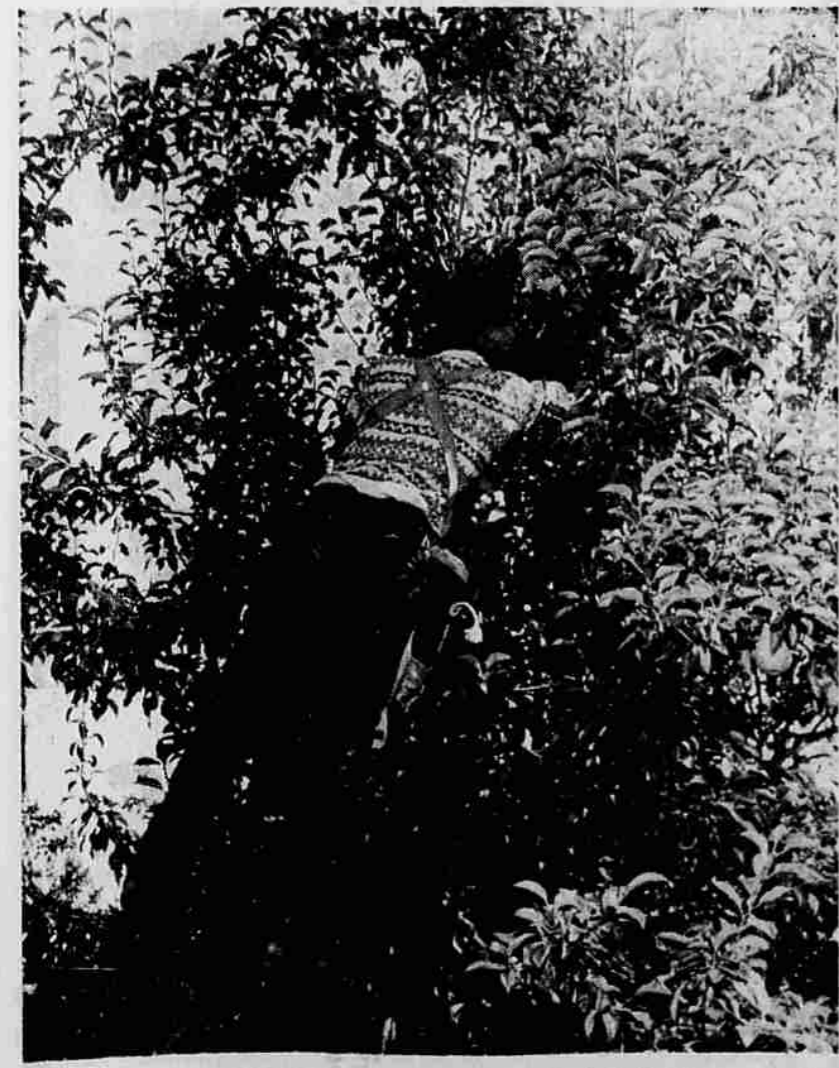
FULL SCALE PEAR HARVEST - The Rogue valley pear harvest is expected to enter full scale tomorrow providing rainy weather doesn't interfere with operations, according to pear industry spokesmen. This picture was taken in the Indian Springs orchard north of Medford last week when picking was still light. Rain nearly shut down the pear harvest today in many orchards. Myron Root and company owns the orchard in which the above picture was taken.

Crater Lake National park officials reported about six inches of snow at the rim during the night, and about four inches at park headquarters. It was snowing lightly there this morning. Snow was reported on the ground this morning at Four Mile lake, but it was not expected to remain long. Irrigation district officials said the rain this morning will have little effect, if any, on the irrigation picture. Continued showers could benefit the irrigation districts, officials said. The greatest benefit to irrigation districts from the storm front which moved across the area over the week end was cooler temperatures, which reduce considerably the amount of evaporation from irrigation canals and lakes, they indicated. The Medford weather bureau station recorded .02 of an inch of rain up to 10 o'clock this morning. Continued cool weather is forecast tonight and tomorrow, and the five-day weather outlook for western Oregon is for temperatures below normal and precipitation more than normal. The precipitation is expected in one or two showery periods, the weather bureau said.