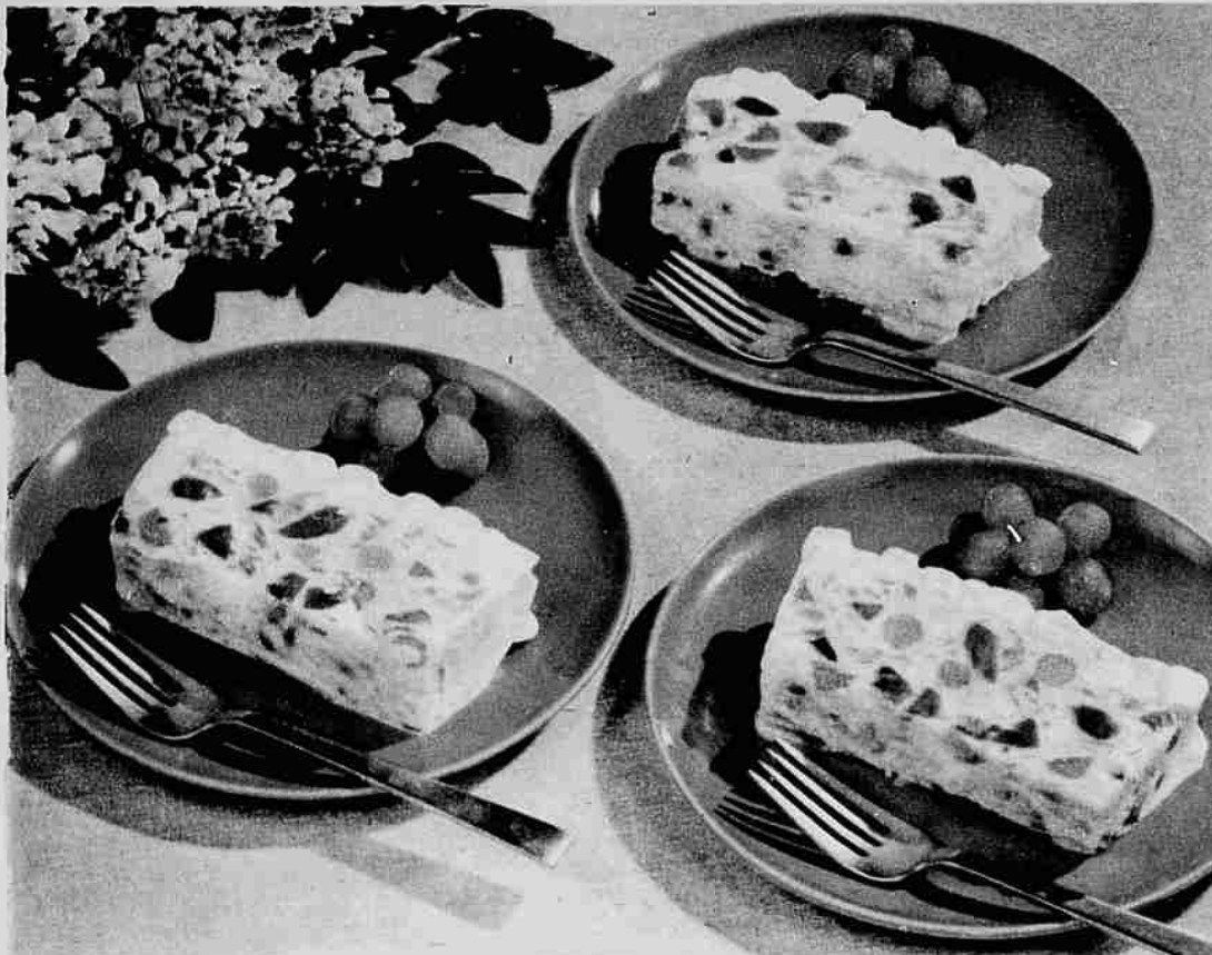
Refreshing Frozen Fruit-Mallow Salad is appropriately served as a salad or dessert.