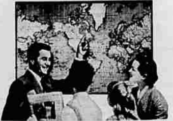
This Giant 50' x 33' 8-Color Map of The World...Yours FREE with additional information about OUR WONDERFUL WORLD

Our Wonderful World is fully encyclopedic in its wide scope of subjects but it's excitingly different in presentation. The subjects are presented in a natural, continual flow—like a story—instead of a mere alphabetical sequence of abbreviated, unrelated items. This fascinating arrangement stimulates the reader . . . takes him deeper and deeper into the world of knowledge . . . opening doors of interest that can set the pattern for future achievements.