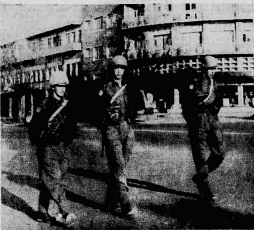
SOLDIERS TAKE STROLL - A trio of Swedish UN soldiers walks down the deserted Place Albert I in Elizabethville, Katanga, Congoles Premier Patrice Lumumba, furious over Secretary-General Dag Hammarskjold's refusal to use the United Nations task force to subdue independent Katanga. President Moise Tshombe, has dispatched a Congolese delegation to warn the UN Security Council against turning the Congo into a "second Korea."