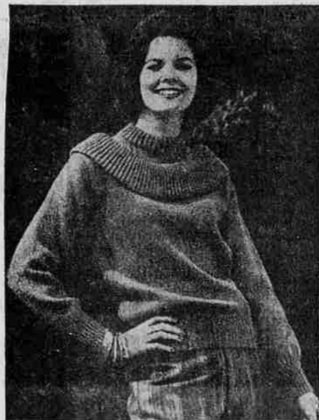
" . . . as advertised in Seventeen "