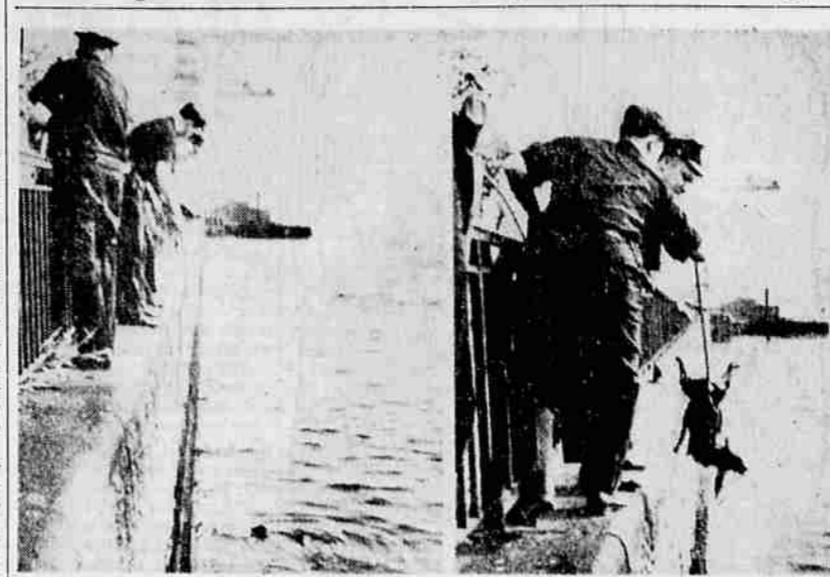
POODLE RESCUED—A dog in distress is miniature French poodle "Chanel," who puts up a valiant struggle against the wet elements after falling into the East river at New York, left. However, police came to the rescue and lassoed the dripping pooch to safety, right, albeit in a rather undignified manner.