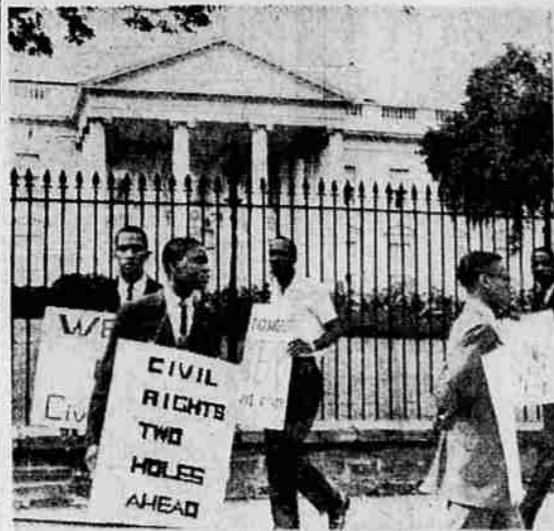
URGE LEGISLATION—A small group of pickets demonstrate in front of the White House today urging passage of civil rights legislation before the national elections. The group was scheduled to march at the capitol later.

Pay landed on a tree and while climbing out of the tree, got snagged in the limbs. He was taken to a hospital.