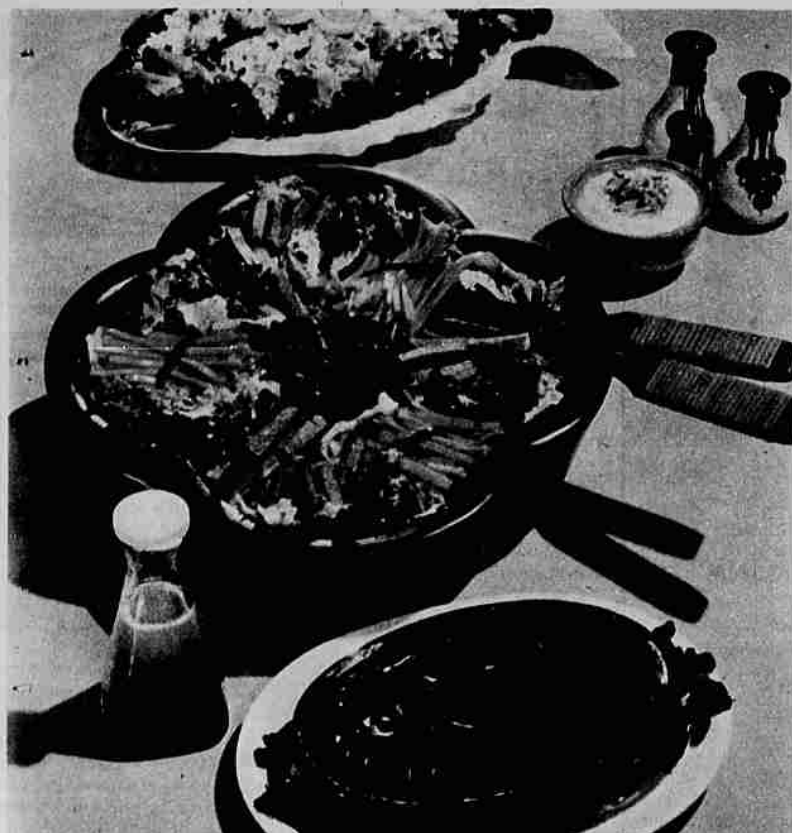
Upper Right, Clockwise: Coconut Cream for Layered Raspberry-Gelatin Mold; Layered Raspberry-Gelatin Mold; garlic dressing for Chef's Salad; Tuna-Rice Salad.

Just before serving, pour marinated mushrooms and artichokes over the salad greens together with the cheese, olives, and bacon; toss lightly. Mix in the croûtons at the very last moment, and arrange strips of meat or poultry over salad mixture in bowl. If desired, garnish with water cress, or sieved hard-cooked egg yolk, or slivered toasted almonds.