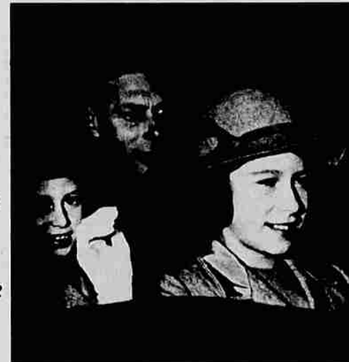
Queen Elizabeth at eleven resembled Anne at age eight.

As she celebrates her 10th birthday, she can look forward to an increasingly public role as the apple of the Empire's eye