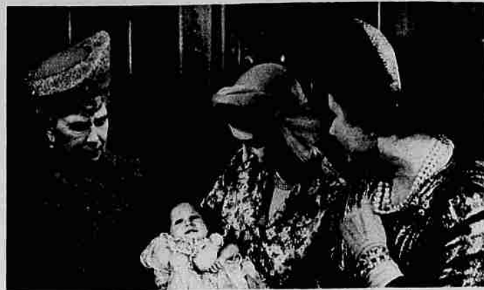
Three queens at Anne's christening: Mary, Elizabeth, and the Queen Mother.