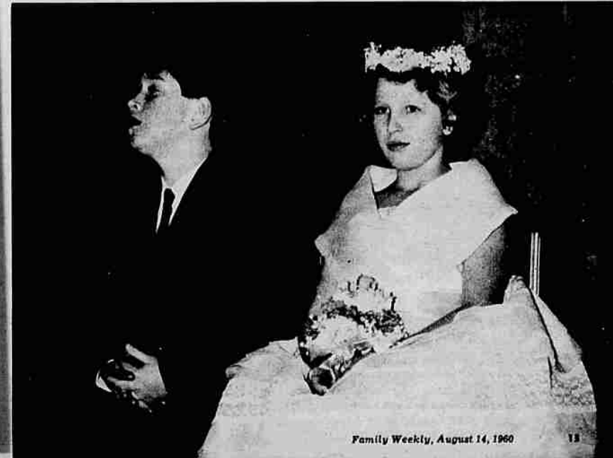
Family Weekly, August 14, 1960