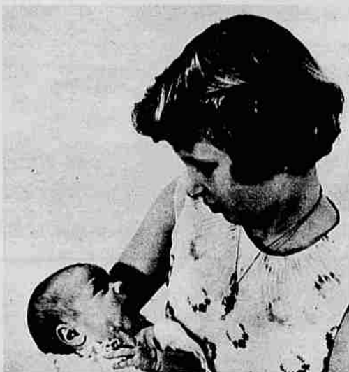
Anne holds her new brother, Prince Andrew, born this year.

To celebrate Anne's birthday, FAMILY WEEKLY presents an album showing the pretty princess through the years and showing, too, the striking resemblance she bears to her mother when she was a young princess.