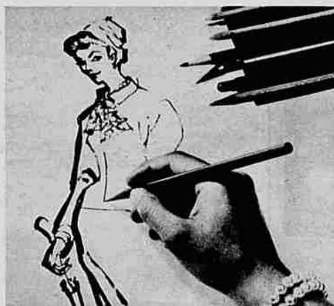
Fashion art is one of the fields now looking for new talent—both men and women artists.