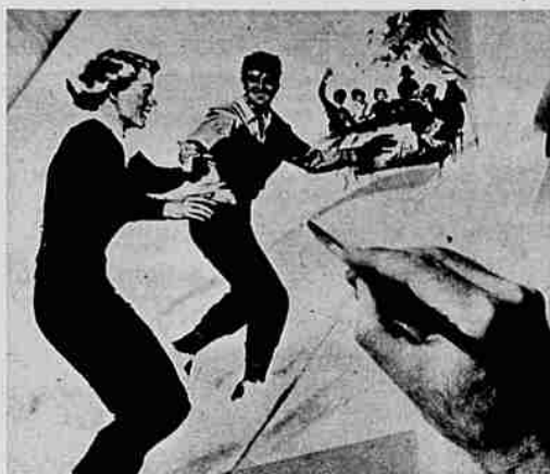
Magazine illustrating is a fascinating field. It's highly paid, too. Fresh new art talent being sought.

...young men and women with talent who'd like to get into commercial art