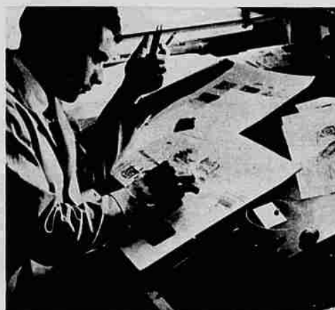
Advertising layouts are made in ad agencies for ads appearing everywhere. More help needed now.