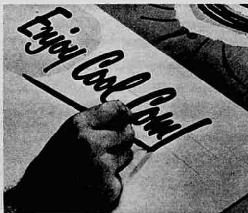
Posters, Signs. You see them everywhere—in stores, store windows, outdoors. Each by an artist.