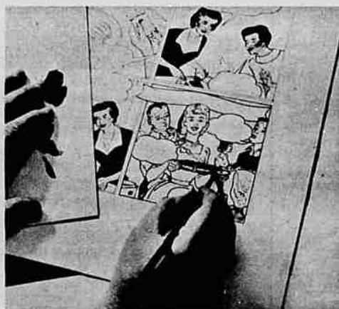
Advertising artists are always in demand. By stores, ad agencies, studios, etc. Even beginners.

ART INSTRUCTION, INC. Studio FW80-21 500 South 4th St., Minneapolis 15, Minnesota