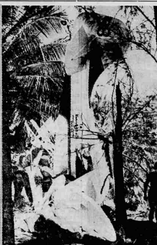
POOR LANDING PLACE - A small plane operated by R. Allen McConnell, 20, a flying student, crashed in pine woods near Miami, Fla. McConnell survived with broken legs and head injuries. The cause of the crash is unknown.

The fire department said the blaze may have been caused by a motor in the top of the building. Harvest grain which had been stored in the grainery was still smoldering late Friday.