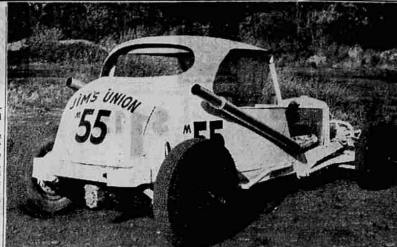
SUPER-MODIFIED ENTRY —The auto pictured will be driven Saturday night by Jerry Fanger, Medford, in super-modified auto races at Ashland speedway. A full program is planned with another $1,000 worth of time trials are planned for 7 p.m. with the first race at 8 p.m.