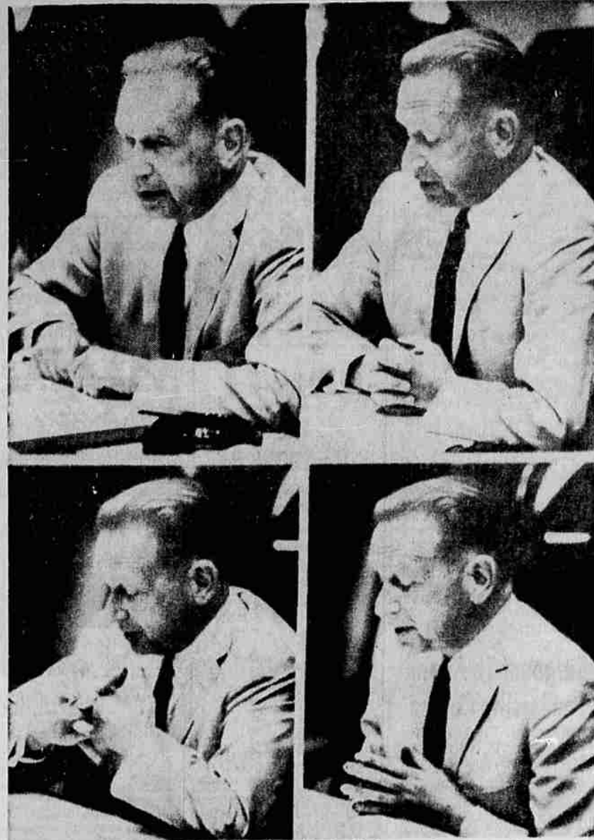
HAMMARSKJOLD SPEAKS - Addressing his hands in varying poses. He warned an emergency session of the United Nations Security Council in New York, UN Secretary-General Dag Hammarskjold uses