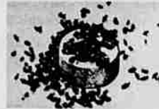
1. After 2 hours