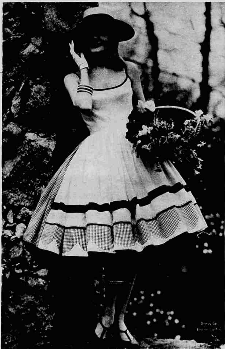
Crisp, fresh, dainty. Smartly styled . . . and so becoming!

Many modern fabrics look better when starched . . . best when starched with instant Niagara